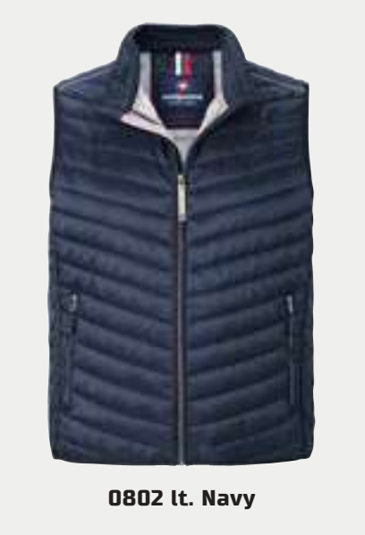
0802 lt. Navy