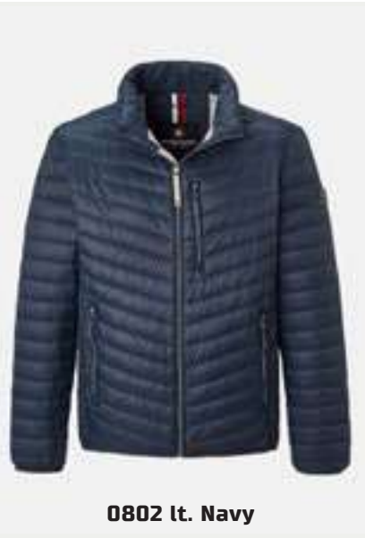
0802 lt. Navy