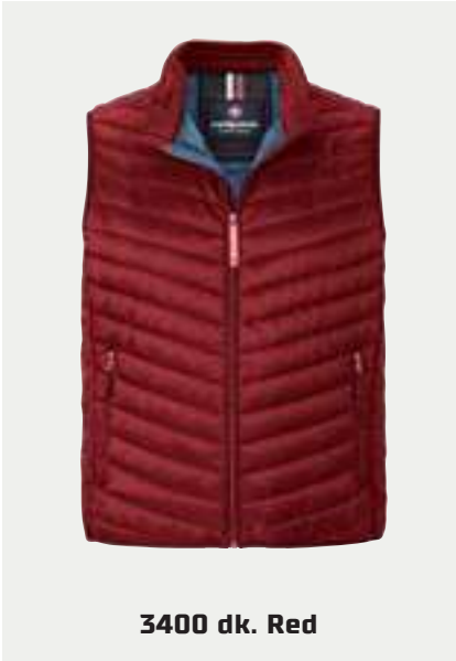
3400 dk. Red