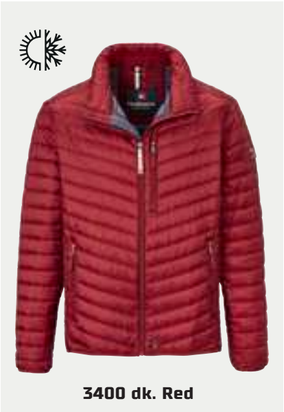
3400 dk. Red